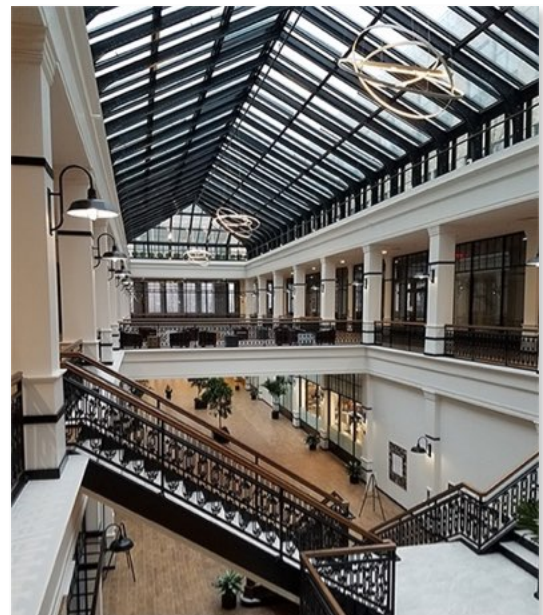
Right: Hahne & Co. Building today as a commercial, educational, and residential center